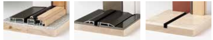
Standard (PG30*** rated)